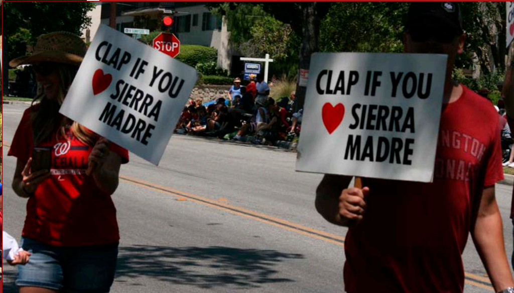
Congratulations to the Sierra Madre Fourth of July Committee for another fantastic event!

Enjoy the photos in this week's edition, You can also view the video captured by Village Vine Online by going to https://villagevine.weebly.com .