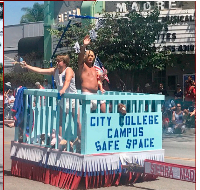
Above