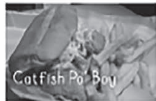
Catfish Po' Boy

On rainy days we normally close early, so please call first.