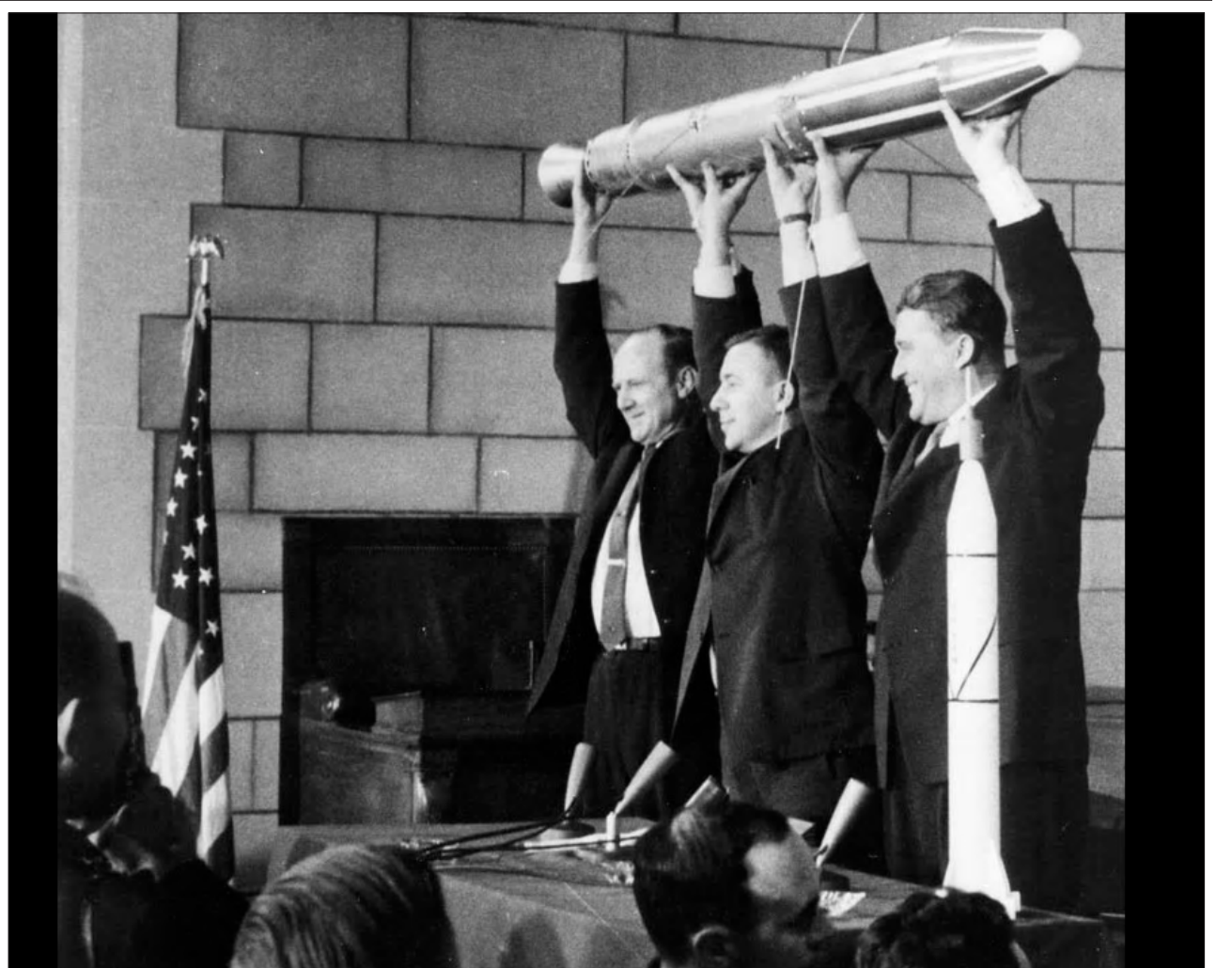
Explorer I Scientists in 1958

COSPAR is celebrating its 60th anniversary this year. It was founded in 1958—the same year the U.S. launched the Explorer 1 [ https://www.jpl.nasa.gov/missions/explorer-1 ] spacecraft, a research satellite built and operated by JPL.