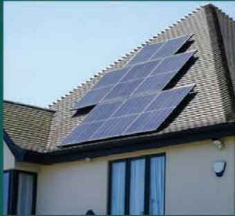
Solar Installation, Upgrade, & Repair