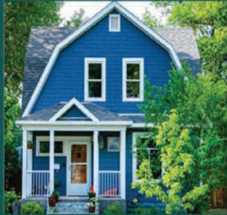
Exterior House Painting