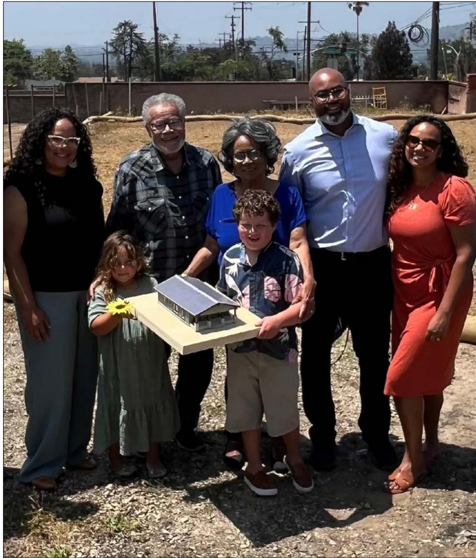
Three generations of the Wood family - all affected by the Eaton Fire through the loss of their homes. They stand here on their cleared lot where SGV Habitat is helping them rebuild.