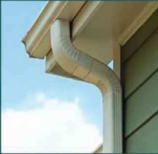
Pre-Painted Seamless Rain Gutters