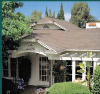
New Roof, Re-Roof, & Roof Repair