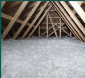
Attic and Wall Insulation