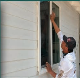
Custom Windows Installed

$500 OFF Complete Roof Replacement (totaling $5,000 or more)