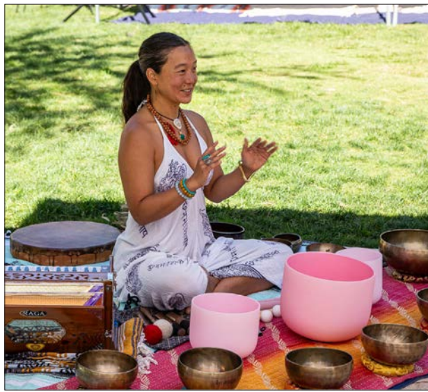
A Sound Bathing class